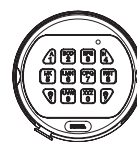
5750-K Round Entry